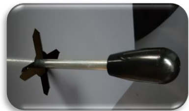
Detail of the 4 way fine control lever